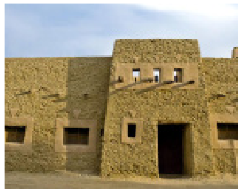
Western Egyptian mud homes