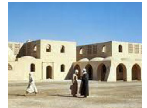
New Gournia Village