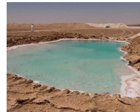
Siwa Salt Lake