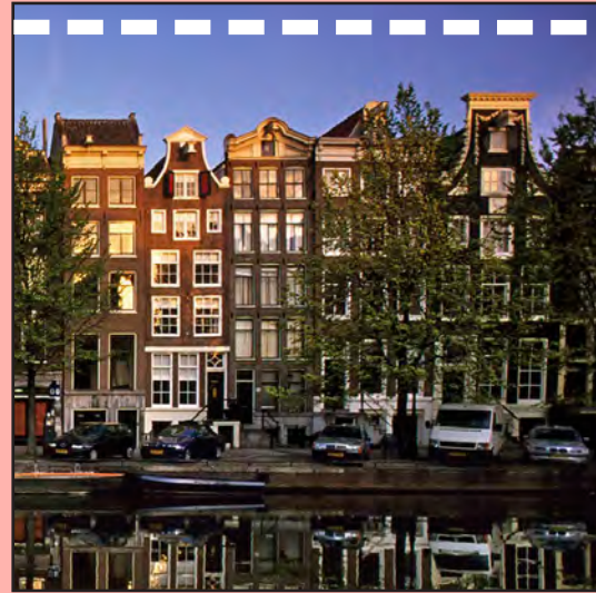
Day 3: A City in Crisis Visit Jordaan and the Jewish Quarter, neighborhoods affected by massive, unregulated expansion in the 19th c.