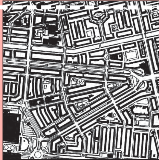
Day 4: The Turning Point Attend the conference for the 100-year anniversary of the Plan Zuid, H.P. Berlage's revolutionary urban plan for the city, and document and evaluate the housing projects of the plan