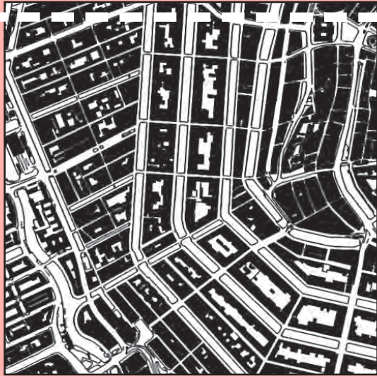
Day 1-2: Beginnings Study early development of city, with typological analysis of canal houses in Amsterdam Centrum as a comparative baseline