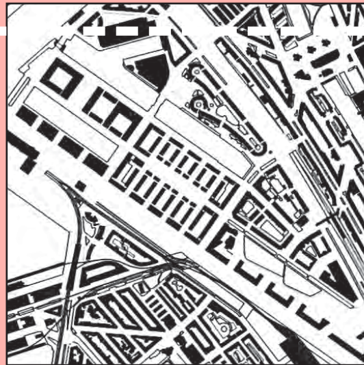
Day 15+: Dissemination Prepare material for RAMSA presentation, explore avenues for publication and share research at the CNU 26 in Savannah, GA