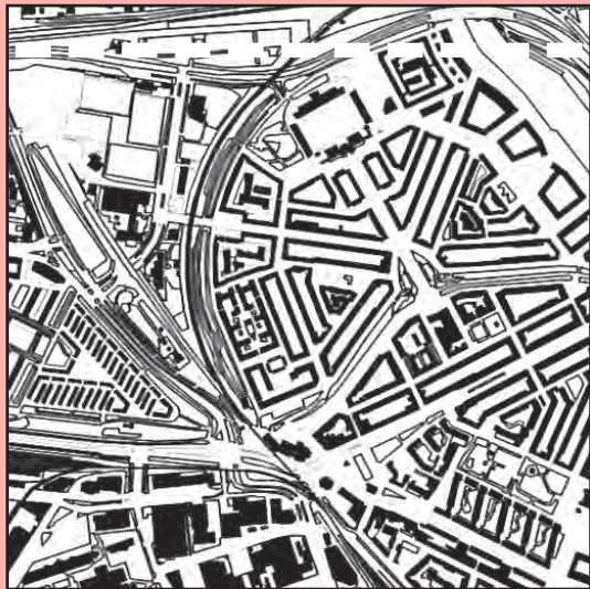
Day 11-12: Straight to the Source Access Amsterdam School Master's drawings and models in the National Archives; visit Spangen of 1921 by J.J.P. Oud and M. Brinkman