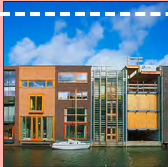
Day 13-14: History Reinvented Appraise the contemporary work of Amsterdam that uses the past as precedent, including the modern housing in the Eastern Docklands and Borneo Sporenburg