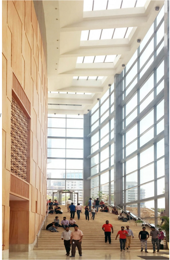
One Horizon Center