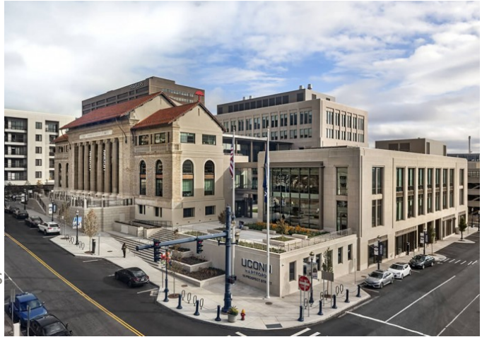
UConn Downtown Hartford Campus