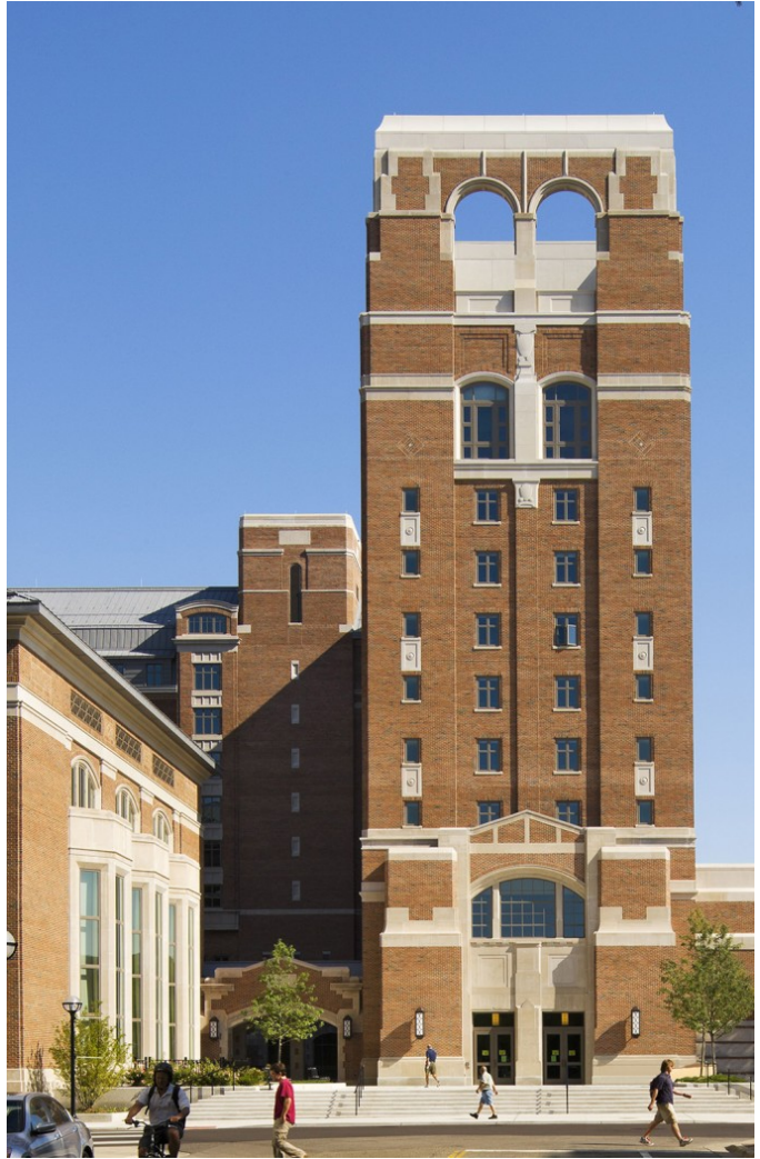
University of Michigan North Quad