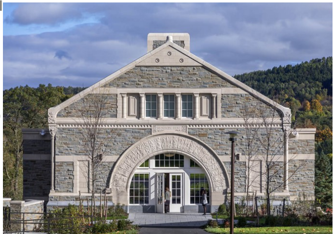
Benton Hall Career Service Building