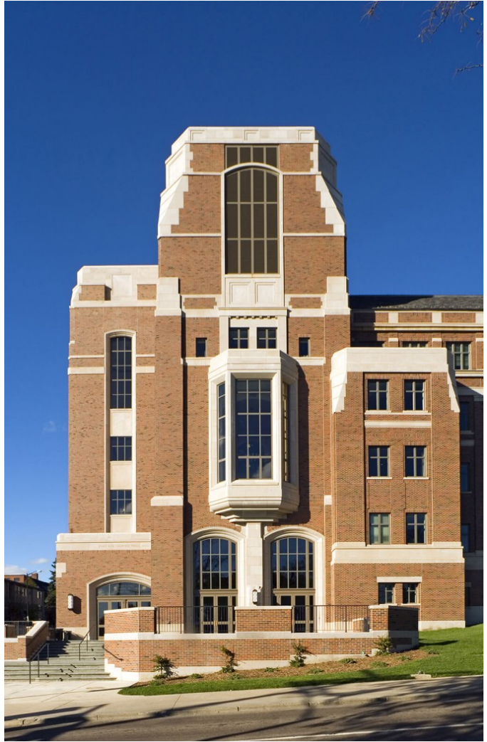
Weill Hall, Ford School of Public Policy