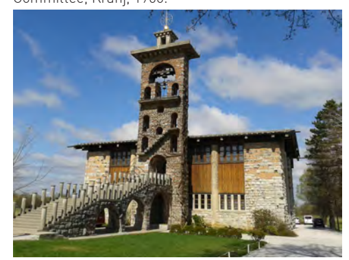
Fig. 9: Jože Plečnik, Church of St. Michael, Ljubljana, 1937-40.