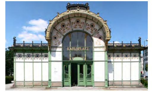
Fig. 7: Otto Wagner, Karlsplatz Station, Vienna, 1898.