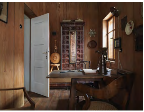
Fig. 4: Edoardo Gellner, Cataloging of existing conditions, Comune di Forno di Zoldo, 1982.

Fig. 5: Jože Plečnik, Plečnik House, Ljubljana, 1930.