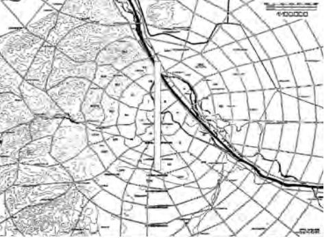
Fig. 6: Otto Wagner, Urban Plan, Vienna.

Fig. 5: Jože Plečnik, Plečnik House, Ljubljana, 1930.