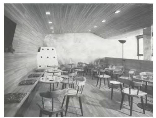
Fig. 1: Edoardo Gellner, Bar Pasticceria 'La Genzianella,' Cortina d'Ampezzo, 1948.