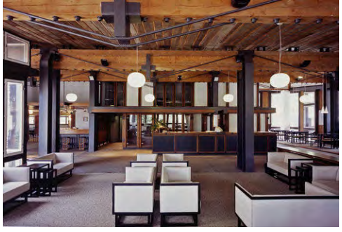
Fig. 2: Edoardo Gellner, Hotel Boite, Borca di Cadore, 1963.