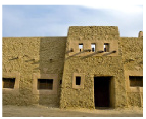
Western Egyptian mud homes