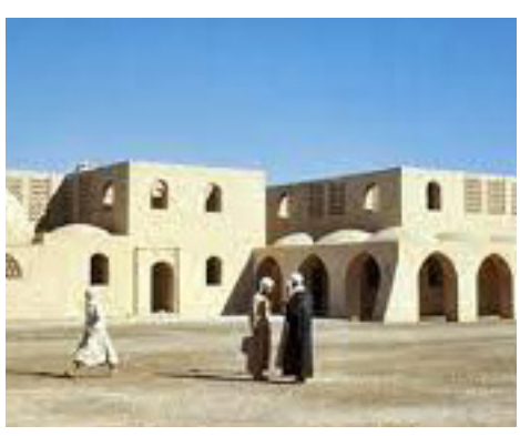
New Gourna Village